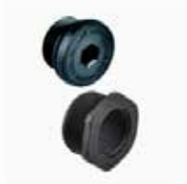
| CZ0220 Series Plastic stopping plugs, the reducer