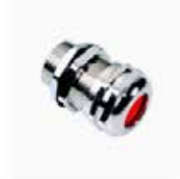
| CZ0221 Metal cable glands