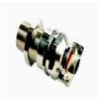
| CZ1725/1C Metal cable glands