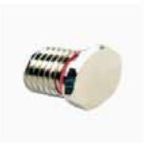
| CZ1725/3A Metal stopping plug