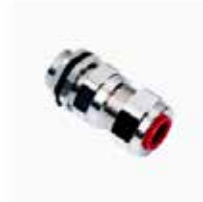
| CZ0226 Increased safety cable glands