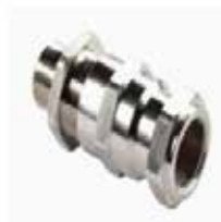
| CZ1725/1B Metal cable glands