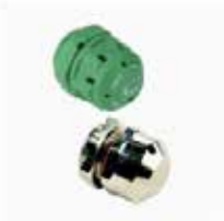
| CZ0527, CZ1725/27 Increased safety breathing, drainage valve