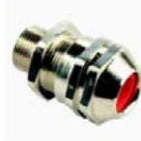
| CZ1725/1A Metal cable glands