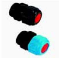
| CZ0220 Series Plastic cable glands, stopping plugs