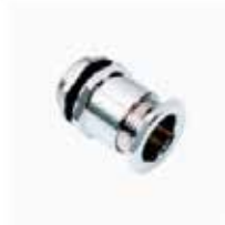
| CZ0227 Increased safety metal cable glands