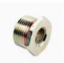
| CZ1725/4A The reducer