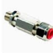
| CZ1725/2A Metal cable glands